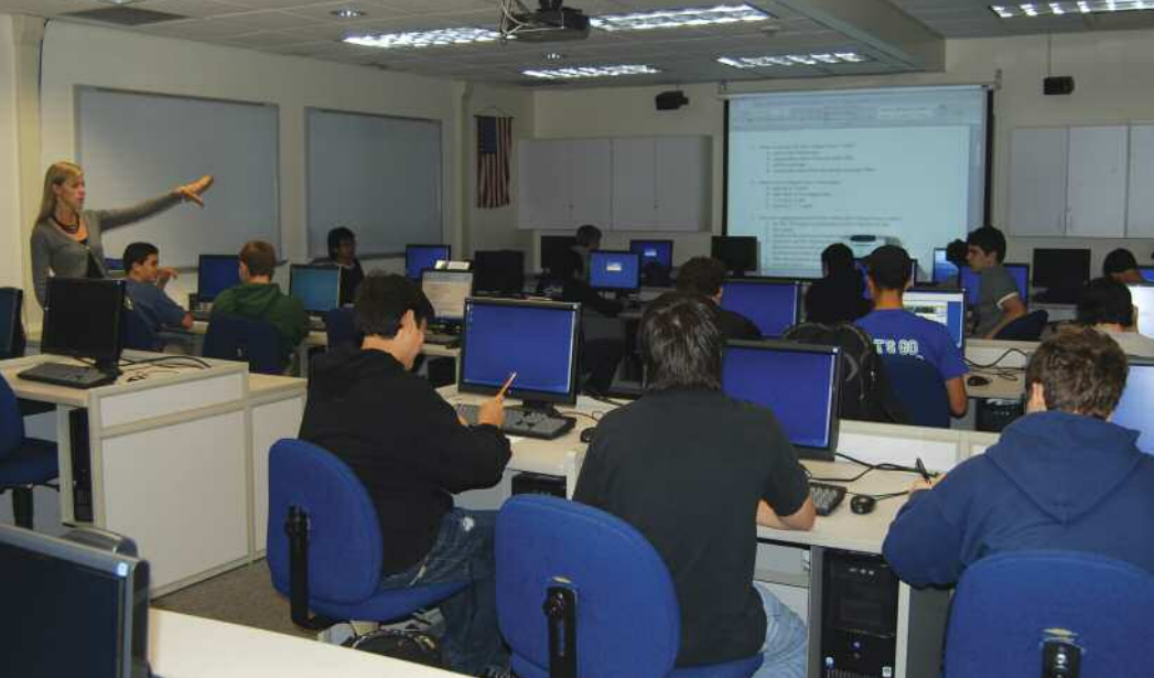
All sophomores participate in Career Orientation during their adviser period.

During first semester of sophomore year, each student participates in a Career Orientation during adviser room period. Students learn about the multitude of services available throughout the Career Development Program. The services that are introduced include: