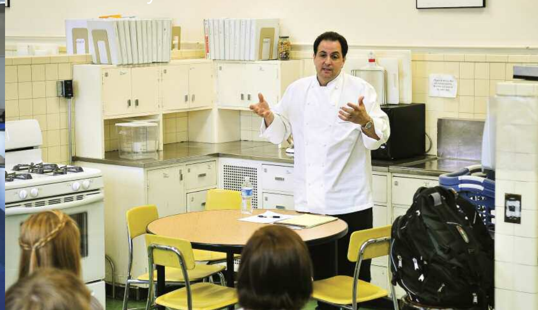
Renowned Chef Rick Tramonto speaks to students about his profession during the annual Classroom to Career Day.

Students also participate in the annual Classroom to Career Day, a day in which local and Chicago area professionals give presentations to classes related to their professions. Over 1500 students have been impacted by guest speakers each year. Our guest speakers have hailed from Kraft Foods, Rick Tramonto's Restaurants, DDB Chicago Advertising, William Wrigley, Jr. Company, KPMG, Jockey International, the Chicago Blackhawks, Lake Forest Hospital, North Shore University Health Systems, WXRT Radio, and ABC 7-TV. International diplomats, entrepreneurs and professionals in the arts and athletic fields have also volunteered as guest speakers for the annual career day.