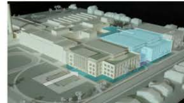
Modular Classrooms/Site Work